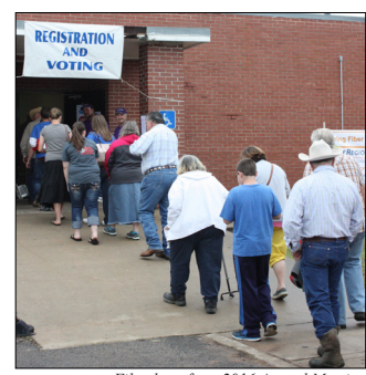
File photo from 2016 Annual Meetin

Under LREC's Bylaws, each year the Cooperative holds an annual meeting the last Saturday in April. This year's meeting is scheduled for April 28th. At the annual meeting, LREC members can meet with the board of trustees and co-op staff and receive an update regarding the Cooperative's activities during the past year. The meeting also brings the annual election of board members, which represents you, the members of the co-op. Members can cast their ballots at the meeting; enjoy a free meal and visit with other members of the cooperative.